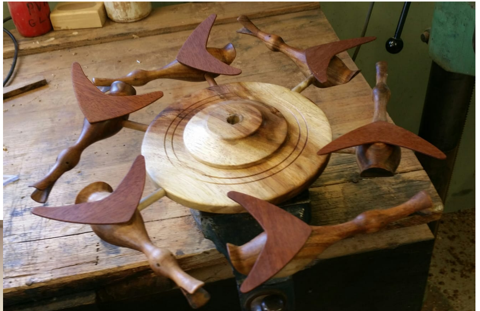
Mal Jackson "Flying Ducks"