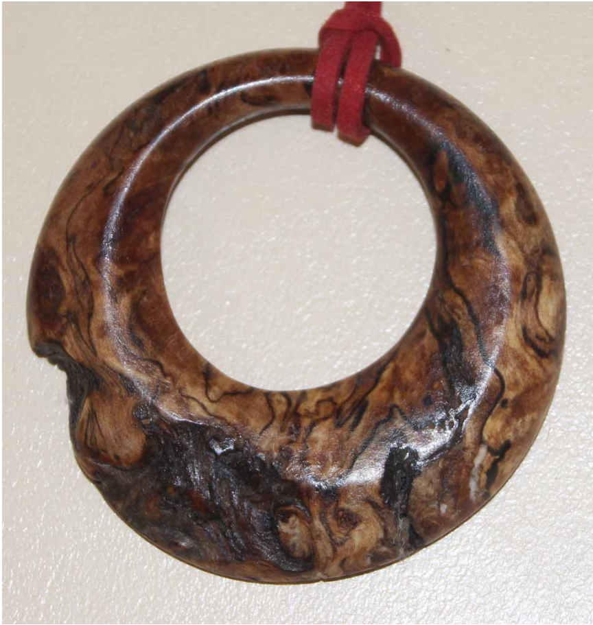
Charles Mercer Necklace