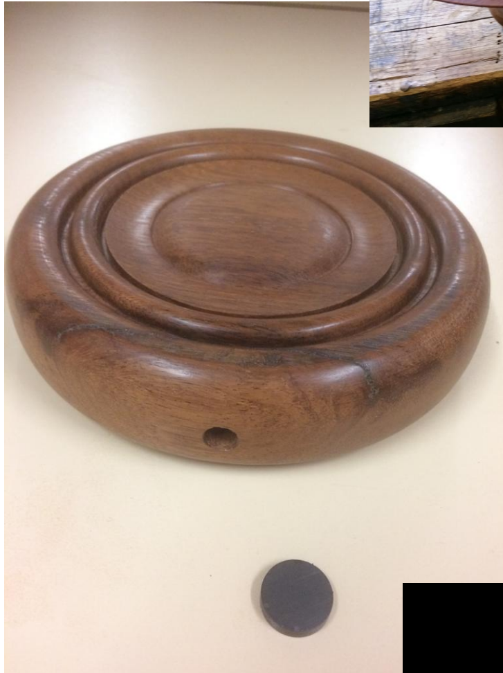
Di Bermingham "Disc"