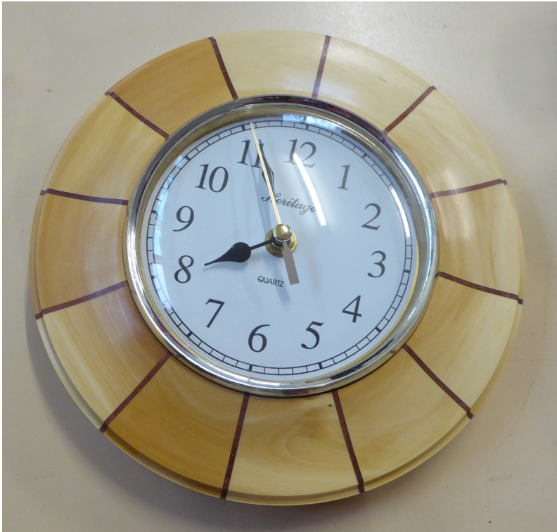
Charles' Clock as described in Tom's eulogy

Who could forget the visit to Charles's workshop (factory). What an amazing space and with a wood fired heater