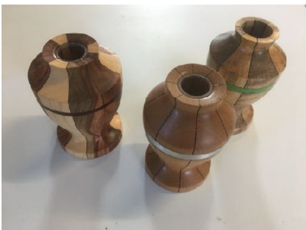
Cliff had some more segmented bud vases one with a band of pewter and the other 2 with a band of epoxy (green and black)