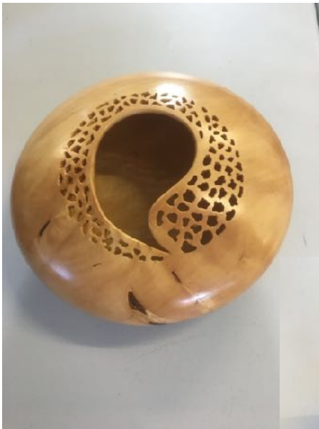
Graham Besley - 3 items a deep hollowed bowl from Huon Pine with perforations around the rim. Next a lidded bowl from Red Gum, then a "reimagined" bowl