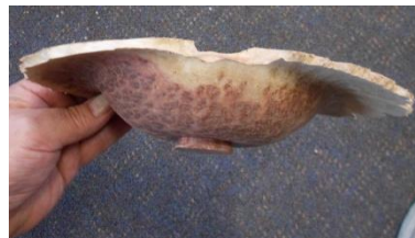
The finished bowl.