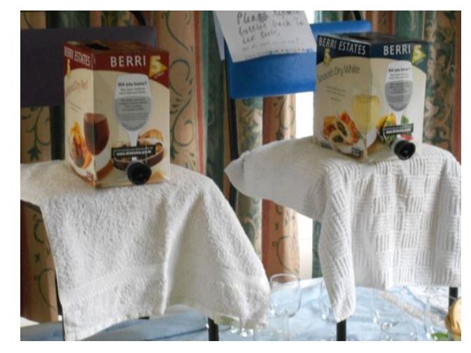
Great presentation Arthur