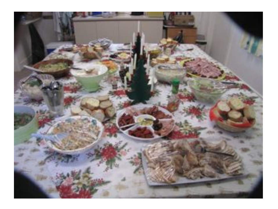
Christmas Luncheon, looks like great tucker, pity the Editor missed it.