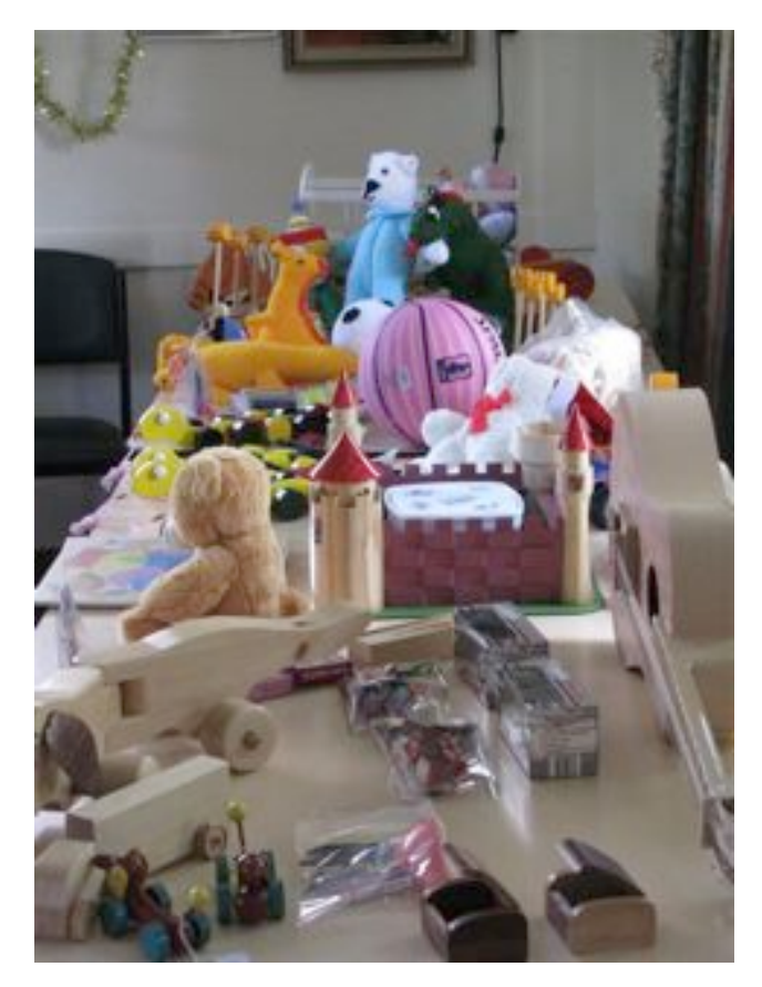
Presentation of Toys to Salvation Army and Eastern Emergency Relief Center. I am sure this made a difference to a number of children for their Christmas.