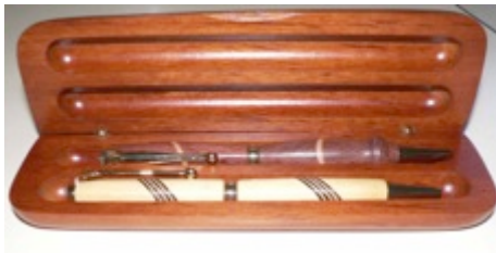
Pens and Whistles by Tom Beswick. Pens are from Coco Bolo and Huon pine finished with Super Glue. The whistles are from Pine.