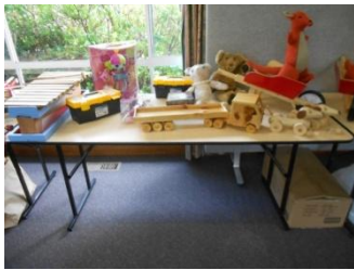
4 tables full of goodies ready for the presentations.