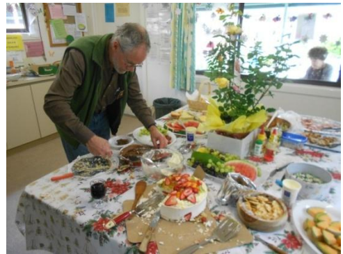
We weren't quick enough to get a photo of the table before the hungry horde hit but this is what remained after first call for desert!