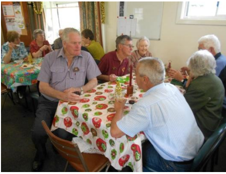
Members enjoying an after lunch chinwag.