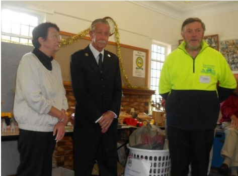
Eastern Relief representative responds with a heartfelt thanks to members.