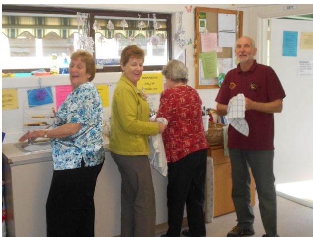
Many thanks to those who stayed and helped the committee with the cleanup. Some of that happy crew can be seen on the left.