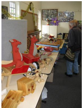
Members examining and discussing