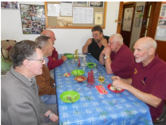
The top table discussing meaty woodturning issues.