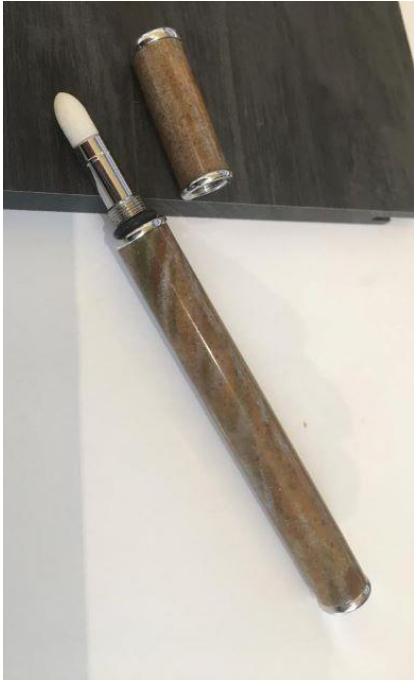
Roger has produced the hardwood vase with timber saved from the firewood heap. The perfume pen is Corian the finish is just sanding with micromesh.