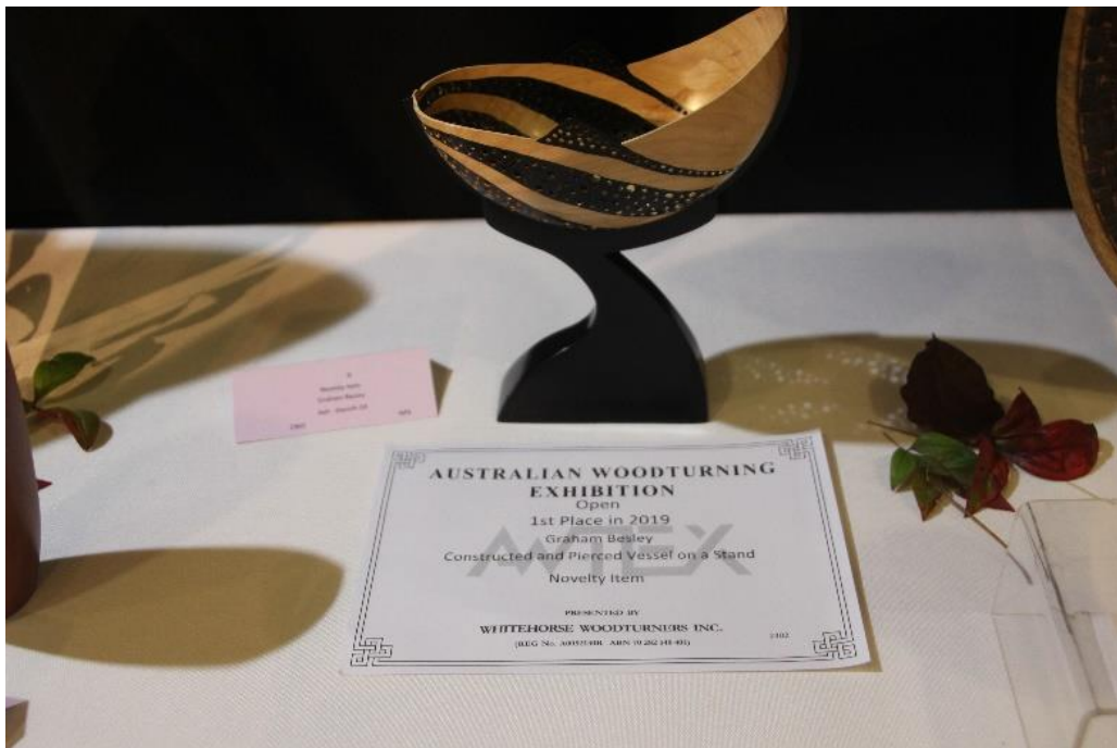
2019 AWTEX Exhibition Graham Besley First Place Open Novelty Item

The Koonung Woodturner's Guild meets at 9.00am on the fourth Saturday of each month at 109 Koonung Road Blackburn North 3130