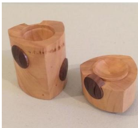
Rick turned this from Cypress Pine and Blackwood