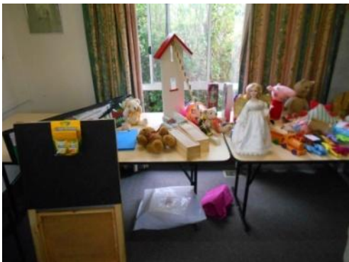
4 tables full of goodies ready for the presentations.