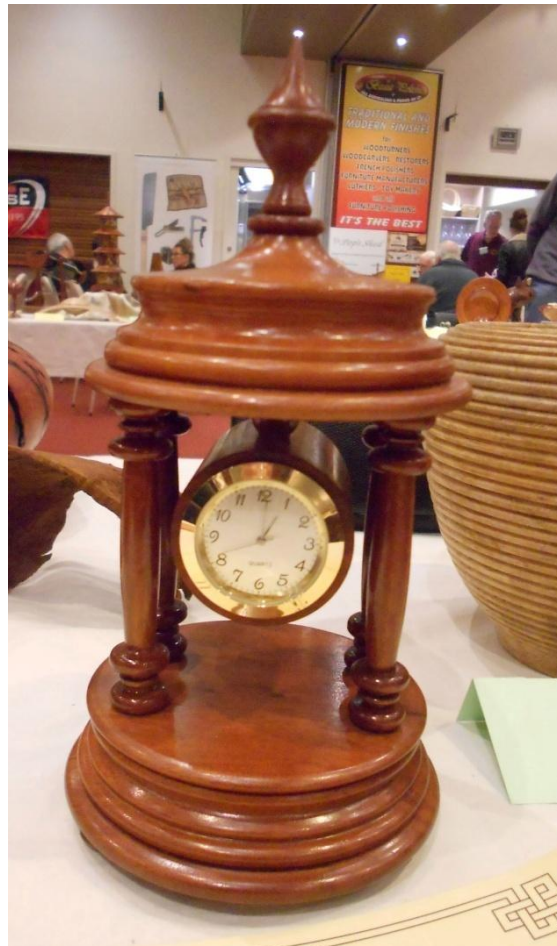
Novice Clock 2nd Place - Frank Larsen Australian Woodturning Exhibition 2014

The Koonung Woodturners Guild meets at 9.00am on the fourth Saturday of each month at 109 Koonung Road Blackburn North 3130