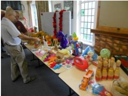
Members examining and discussing the donations