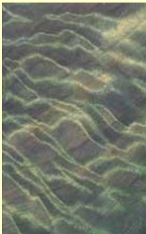
Figured box elder with green spirit stain

Coloring your work is a simple way to begin your exploration into decorative embellishments for your woodturnings. These and other creative explorations, focus your inner muse in new and exciting ways as you continue to define your own unique style. Always strive to challenge your artistic beliefs and values. Through the years, I have developed and matured as an artist by getting out of my comfort zone and challenging myself creatively.