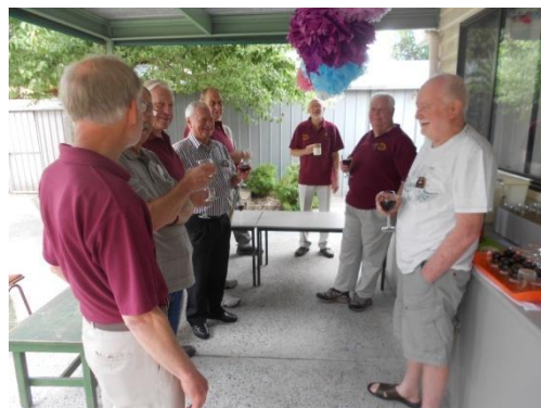
While the button presentation was progressing, other members set up the tables for the luncheon and laid out the food while others found that christening the bar was more to their speed.